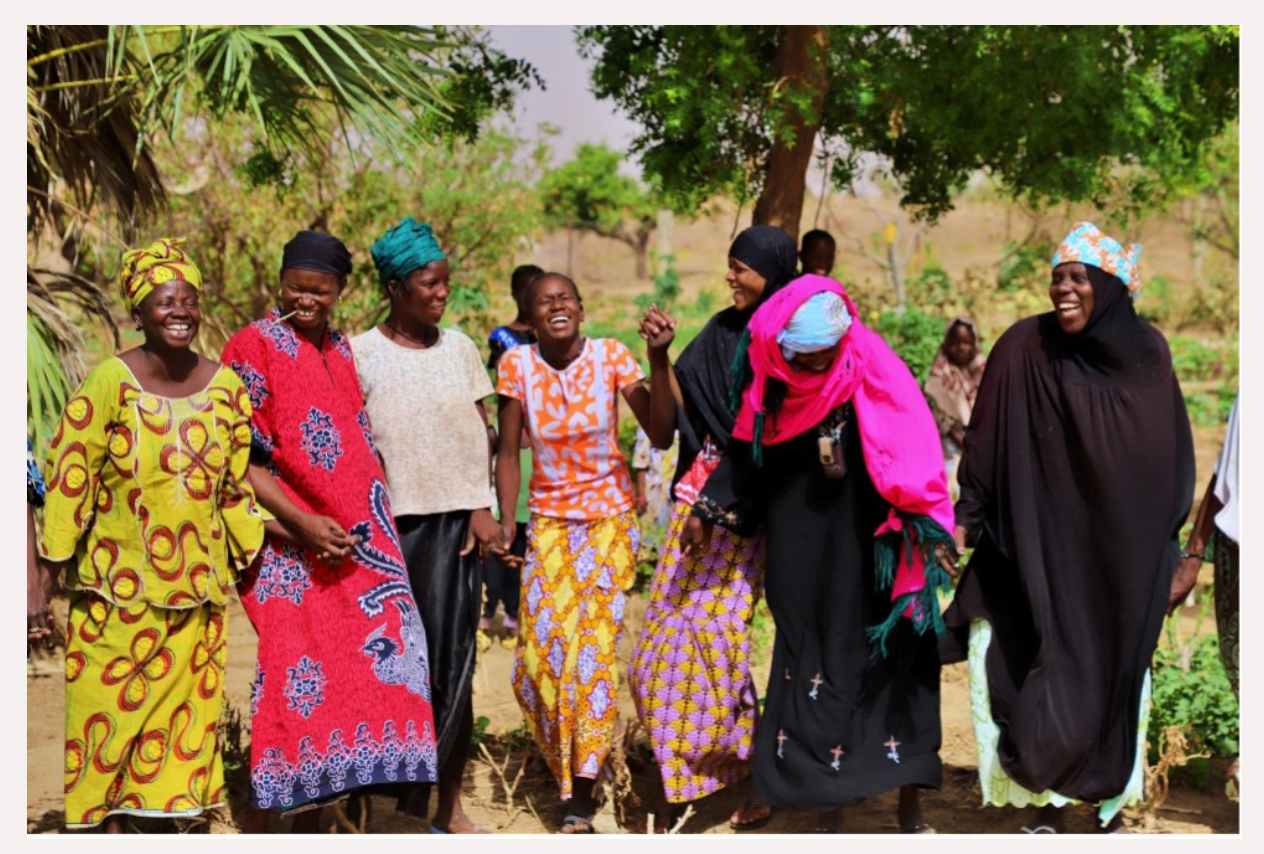
The women of the various S4T saving groups in Gouba Inna.

The project had two phases. Phase I (2013–2015) promoted FMNR and other CSA practices, including conservation agriculture. Phase 2 (2016–2018) added Savings Groups and Local Value Chain Development interventions to strengthen financial resilience and increase income through enhanced access to markets. This project is an example of how strong collaboration between World Vision and the Government of Mali, coupled with innovative and evidence-based interventions, can improve participation in FMNR and ultimately build resilience, restore livelihoods, and improve child health in a sustainable manner.